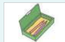
필통 pencil case