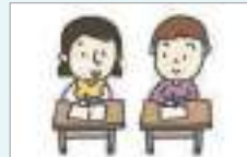
반 친구 classmate